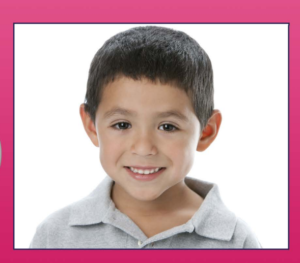
FROG STREET PRE-K