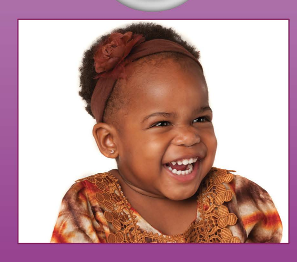
FROG STREET THREES 36-48 MONTHS